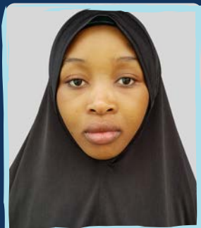
Hadija Student Support Worker