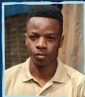
Goodluck Caretaker (Kariwa Shelter)