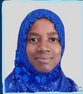
Aziza Student Support Worker