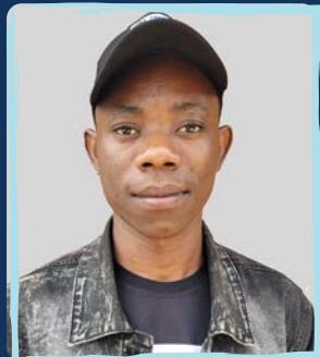
Omary Caretaker (Moshi Town)