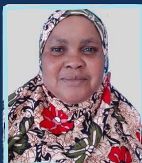
Ummy Student Support Worker