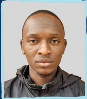
Abdi Caretaker (Moshi Town)

We are very proud of our staff and volunteers who play an incredible role in managing our projects, running activities and overseeing the welfare of our children and young people.