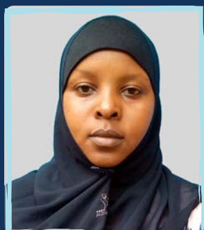
Ulfah Student Support Worker