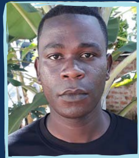
Damas Student Support Worker